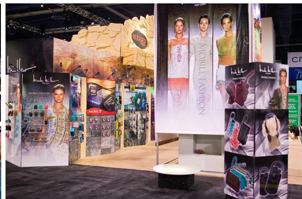
Above: On the opposite end of the rustic desert displays, there are fashion display cube graphics and graphic panels on hard board