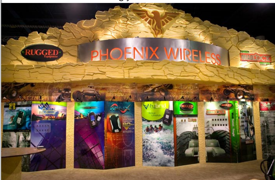
Above: The rustic atmosphere is beautifully complimented by graphic panels mounted to hard boards with 3-D products, logos, & headers jumping off the panels