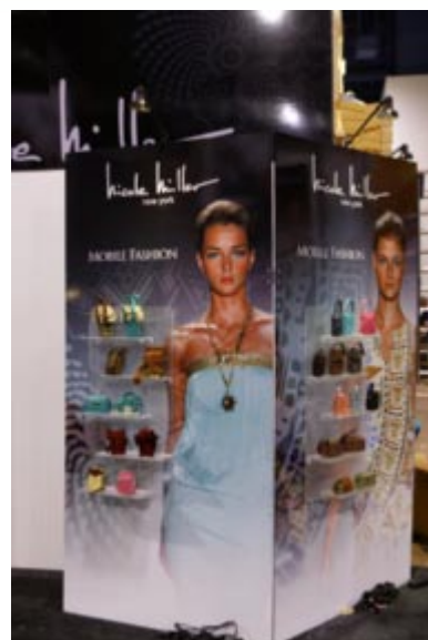
Above: What do you do when your show space has a large 4'x4' column with an electrical transformer mucking up the view? Answer, hang some 7'x12' full color banners over the ugliness