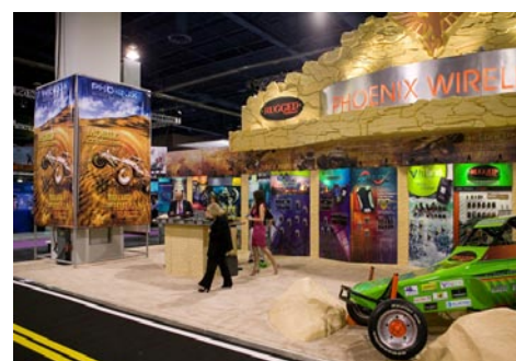
Above: What desert theme would be complete without a dune buggy? The vehicle above had permanent vinyl adhesive graphics designed to match the contours of the body & color of the vehicle paint